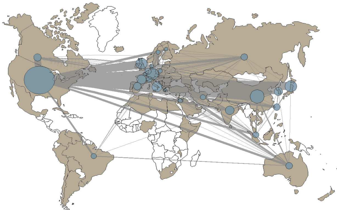
Figure 2: Global distribution and patterns of collaborations of publications on nanotechnology

Data from the last twenty years exhibit a notable correlation between publications on the subject of nanotechnology and patent applications with a focus on nanotechnology (see Figure 3). Both activities have grown in a marked and sustained fashion since the early 1990s.